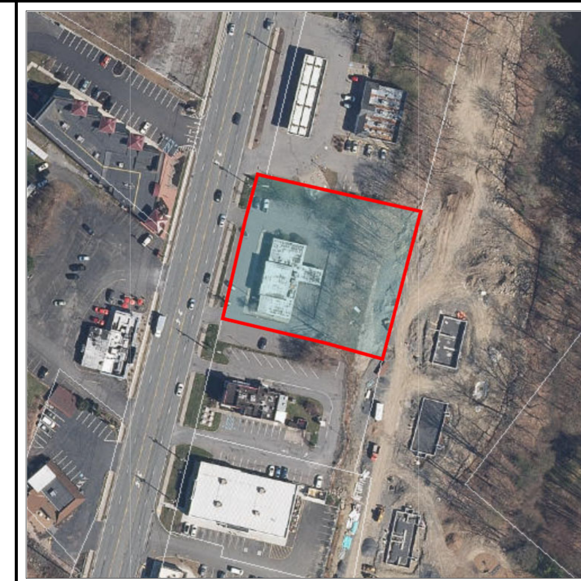
LOCATION MAP SCALE 1"=800'